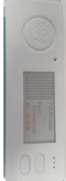
Fully charged tag