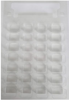
Clear plastic tray