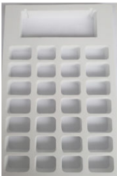
White foam platen