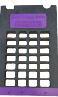
Black foam platen

Before you start you will need these seven components.